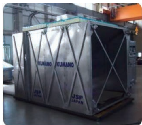
Patented generator structure granted on Nov. 5, 2013, Patent # US 8,575,771 B2.

With impellers measuring 10 meters by 40 meters and a flow velocity of 2 meters per second, the system generates 952 kWh, equivalent to 8,337,522 kWh annually.